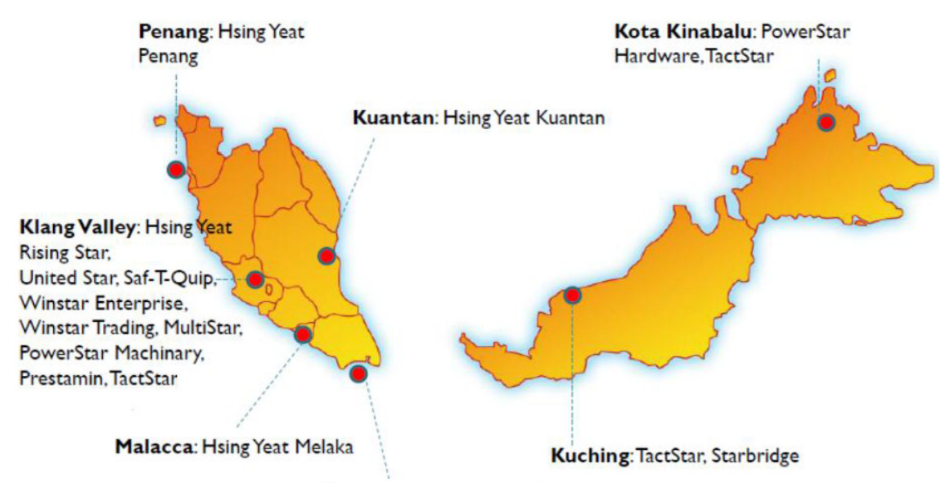
Singapore: PND Hardware & Trading